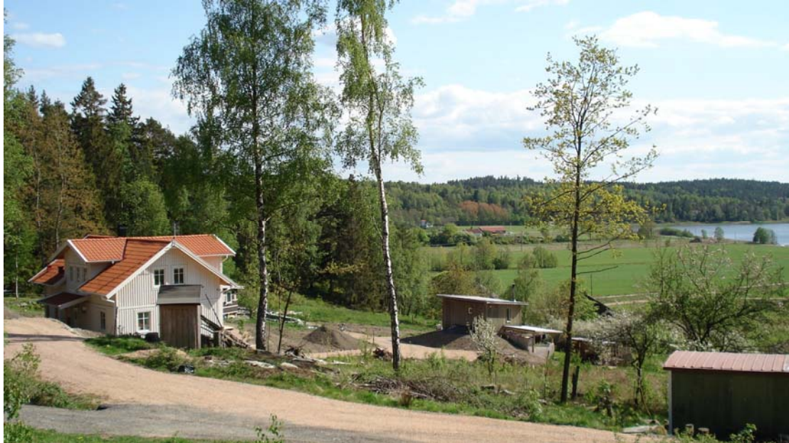
View from the hill in Lilla krossekärr