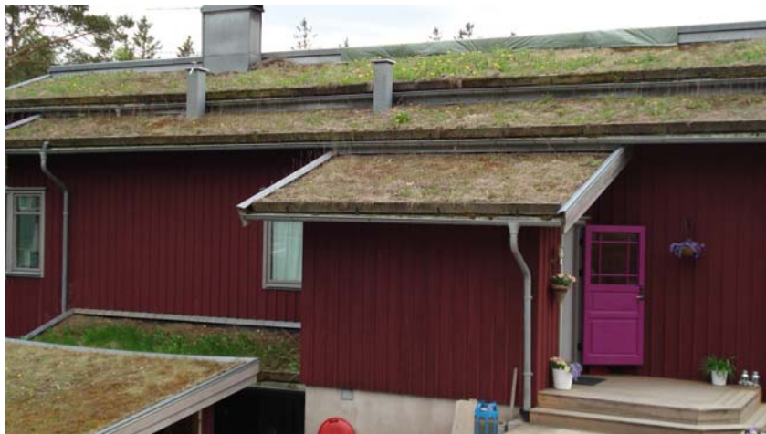
A house in Rydebacke

The eco-village Rydebacke lies about forty kilometres east of Gothenburg, in the municipality of Ubbhult. Located in a forest area close to a larger lake, the village is in a peaceful setting, well hidden and surrounded by trees. Nearby you can see the cows grazing from the neighbouring farm Gunnargård. Rydebacke is the home of about 30-40 people and it is well visited by media, tourists, students and people from other eco-villages. The economic association Linden, one of the three associations that make up the organisational part of the village, was founded in 1991 and had at that time four members. This small group of people had the idea of creating an ecological community close to Gothenburg. It turned out to be hard to find suitable land close to the city, and when the land in Ubbhult was found they decided to stay and build the village in cooperation with the farm Gunnargård (Rydebacke homepage). The idea of the eco-village was not well received by all neighbours and the group had problems getting permits to build and settle down. These problems resulted in increased costs, among other things. It was decided that a new road had to be built which turned out to be an expensive and time-consuming procedure. The road was finished in 1995 and then the building process could start.