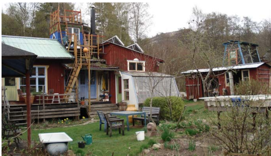
A house in Skärkäll

A couple of attempts have been made with larger scale cultivations but these projects have not been successful and have been put to rest due to lack of commitment and time (Skärkäll 1, 5). There is however a wide interest in farming in the village and many households have their own kitchen garden and cultivate vegetables for the household (Skärkäll 1, 5). There seems to be hope and desire for an increased self-sufficiency regarding cultivation and energy production.